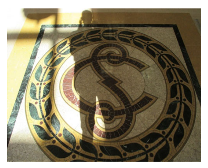
Figure 9 Logo of the Supreme Court of Canada by Ernest Cormier.