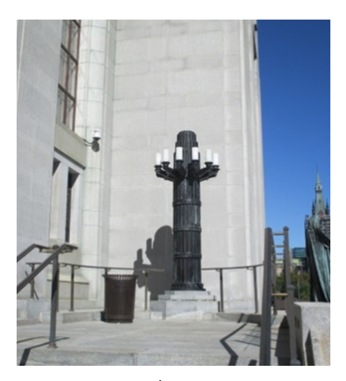
Figure 7 Candelabra by Ernest Cormier.