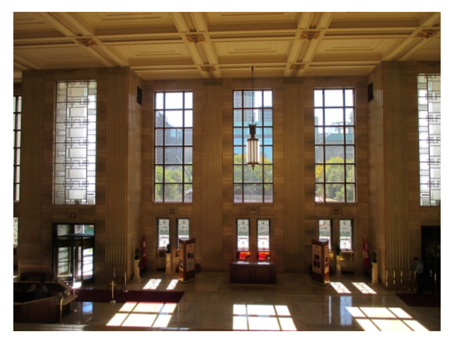
Figure 10 The Grand Hall and main entrance (photo by the author).

light help to deliver much better trial outcomes in which participants are more relaxed and better able to concentrate for longer period of time' (Mulcahy, 2011, p. 155).