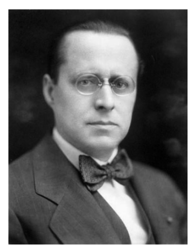
Figure 2 Ernest Cormier, architect of the Supreme Court building.

Perhaps most crucially, Cormier had to contend with the often fickle tastes of senior public servants as well as the prime minister himself, who had insisted on personally overseeing the building of the new courthouse. King's critique of the proposed building, as recorded in his personal diary, reflected his rather old-fashioned notions of architecture. For instance, he felt the Court was 'too modern and of Muscovite inspiration, comparing it to a factory' (Canada and Supreme Court, 2000, pp. 203-204). Therefore, in order to please the king, Cormier added a few traditional elements, such as a massive copper roof.7