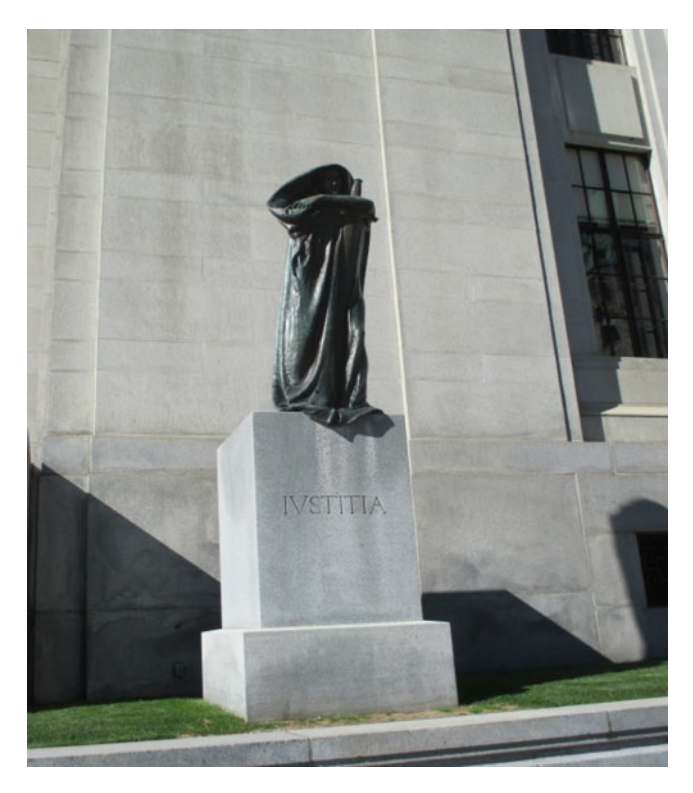
Figure 5 Iustitia Lady Justice statue by Walter Allward.

Cormier's specific thoughts about the addition of the two statues are not known but, based on the rest of the Court's aesthetic, and his notorious need to be involved in every area of designing the building, we might assume that he would at best feel ambivalent about them. At worst, I suspect he might have rejected them altogether for cluttering the elegance of the Court's facade and being rather too traditional as imagery.