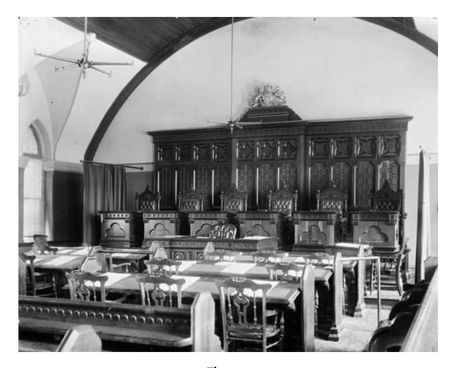
Figure 1 The original courtroom of the Supreme Court of Canada.

The picturesque or châteaux style had risen to prominence in the late nineteenth century<sup>5</sup> and had quickly become the preferred school of public architecture in Canada. However, the style would have to be modified, to some extent, in order to suit the demands of a functional courthouse building.