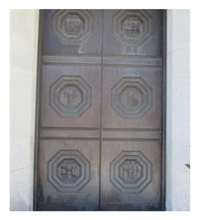
Figure 8 Bronze doors designed by Ernest Cormier and Henri Hébert.