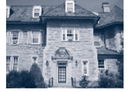
Exterior air conditioning units and entrance of 24 Sussex Drive